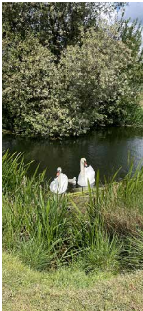
Cover: Floral Letterbox, Ferry Lane, Medmenham. This page: New baby.