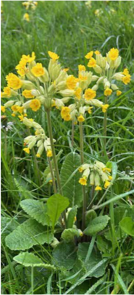
Cover: Palm Sunday Procession at Medmenham. This page: Cowslips at Kenricks, Hambleden