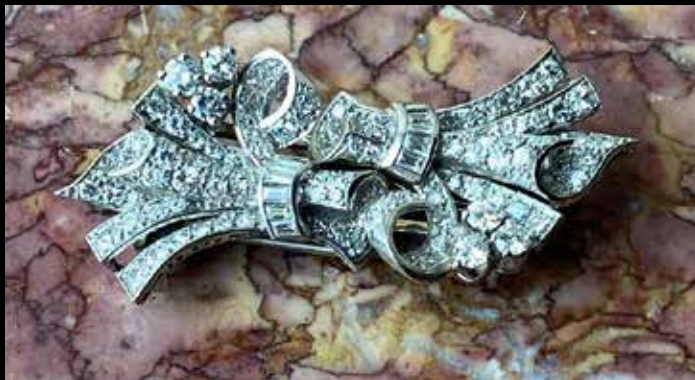
Late Art Deco double diamond clip brooch | Sold for £3,125 www.thepedestal.com | +44 (0)1491 522733 | valuations@thepedestal.com

Our Luxury Design auctions feature fine jewellery, silver & designer handbags | Contact us to consign to the next auction