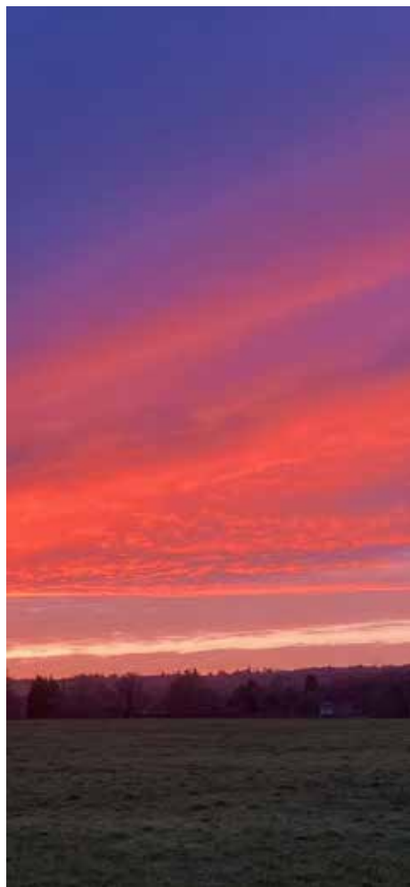
Cover: Rev Sue Morton and pumpkin, Harvest at Turville. This page: Sunset at Mill End.