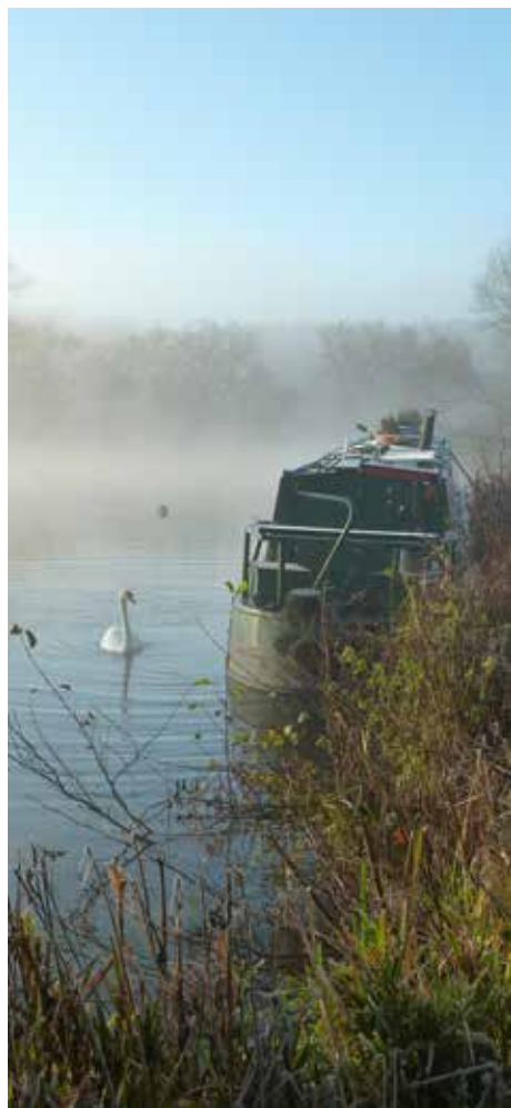
Cover: St Bartholomew's, Fingest in the snow. This page: Mist over the Thames.