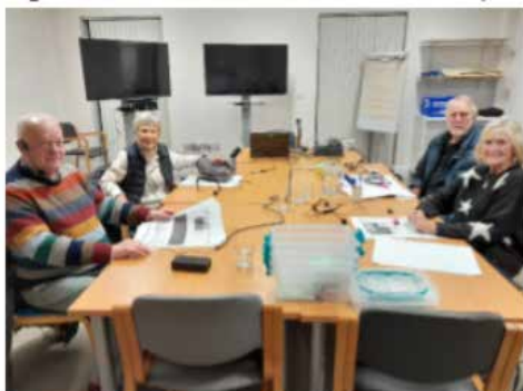
A typical wireless free recording set-up!

For more than forty years, the Henley Talking Newspaper has been quietly transforming the way people in our community stay connected. Established in 1982 and run entirely by volunteers, this independent charity provides weekly audio recordings of local news for anyone who finds reading difficult—whether due to sight loss, health issues, or being housebound.