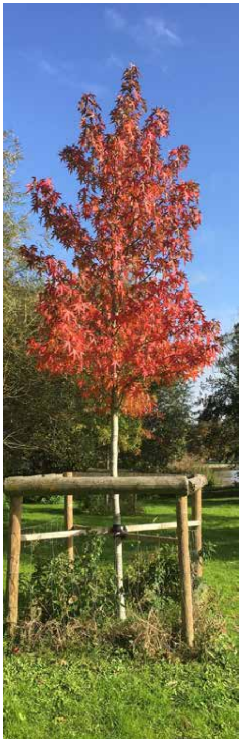
Cover: Christmas flower arrangement at St. Bartholomew's, Fingest. This page: Liquidambar autumn colour, Medmenham.