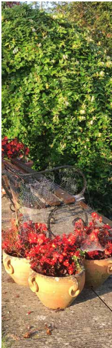
Cover: Fawley's War Memorial with new ceramic poppy wreath. This page: Cobwebs shown up by autumn dew.