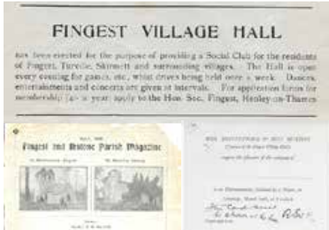
Advertisement for Fingest Village Hall published in the Fingest and Ibstone Parish Magazine April, 1936 and a ticket for entertainment and dance held on 11 th March, 1933

club run by the Hall. Slate clubs were friendly