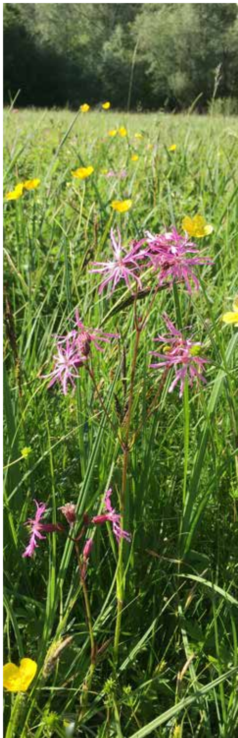
Cover: Hambleton Celebrated the Coronation of King Charles III, Lychgate Cottage. This page: Ragged robin.