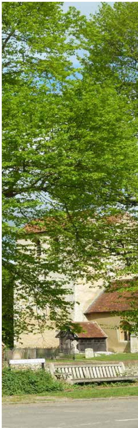
Cover: Lady Hambleton's Easter Bonnet. . . This page: St Bartholomew's in the spring.