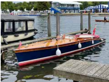
Andrews Greyhound Slipper Launch No. 376 was built in 1952 by Andrews of Bourne End,