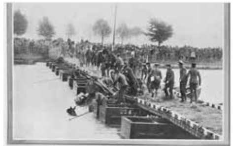
Medmenham Ferry Pontoon Bridge disaster 1913