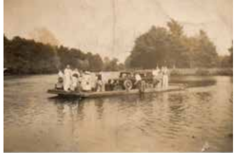
Medmenham Horseboat (1920-30s)

which it was cleared away. A keen recycler, he salvaged much of the bridge material.