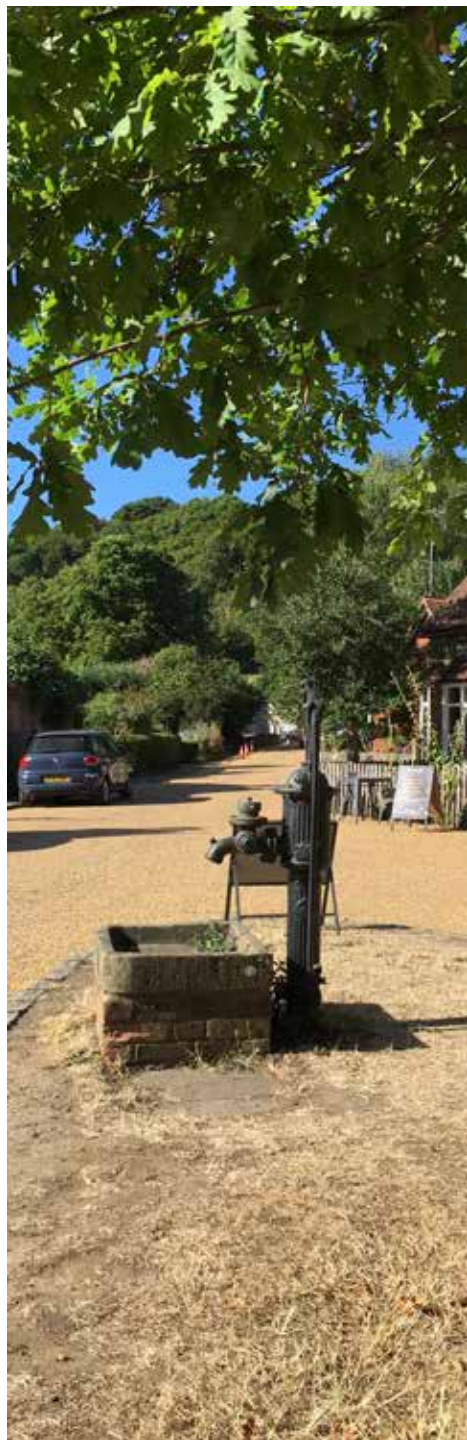
Cover: Drought in the Hambleden Valley. This page: Lovely new road surface in Hambleden.