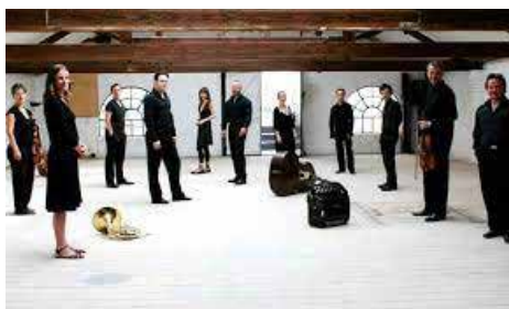
CHROMA chamber ensemble at Northend Village Hall

On 18th September, following on from the fantastic recital with the Edenis String Quartet in May, there'll be another concert in the beautiful setting of Northend Village Hall. For many years I've worked with the award-winning ensemble, CHROMA and they'll be giving two concerts - at midday and 3pm - of music for clarinet,