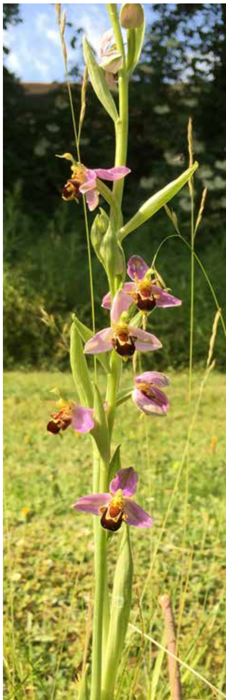
Cover: A sea of Cow Parsley in Hambleden Churchyard. This page: Bee Orchid in Medmenham Churchyard.